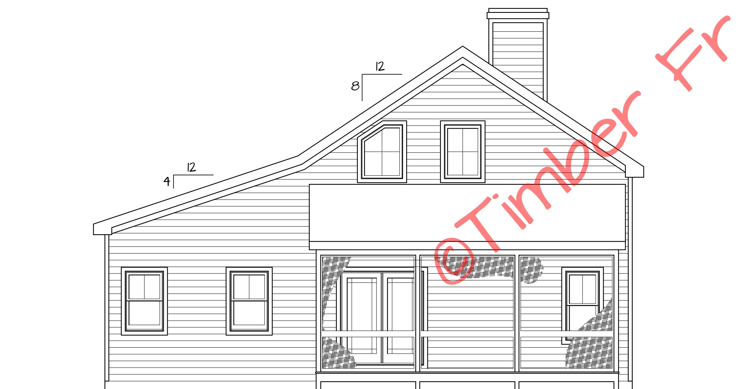
Left Side Elevation